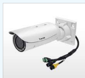
Embedded PoE Extender